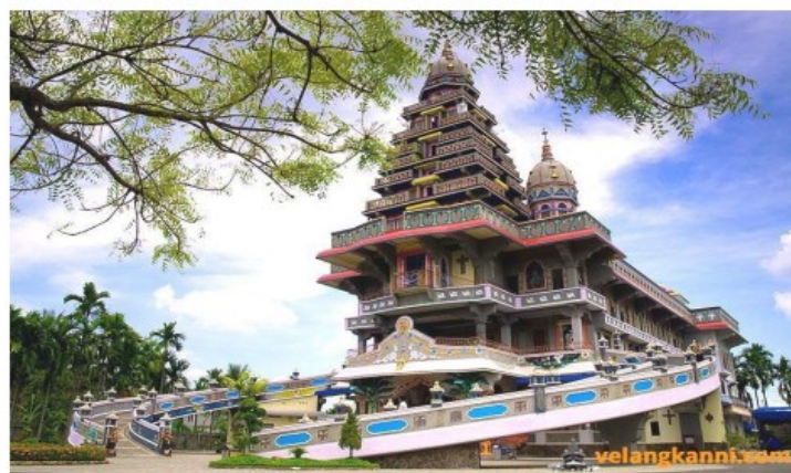
The Marian shrine of Annai Velangkanni, in Medan, Indonesia

Justice and only justice, you shall pursue (Deuteronomy 16.18-20)