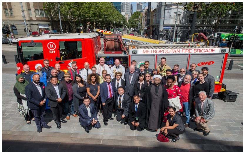
Photo of Faith leaders including the Executive Officer of the VCC with Emergency workers who were honoured and thanked at the Prayer time.

The Faith Leaders were joined by members of the Victorian Parliament with the Premier, Opposition Leader and Leader of the Greens also speaking.