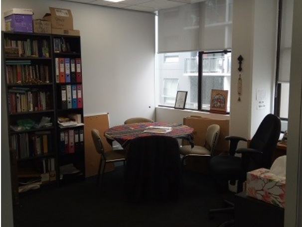
Left is a photo of the new VCC office

During the past month the Office of NCCA, Act for Peace, PIEN, APAN and VCC have moved. - some images of new facilities