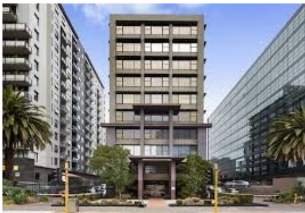
608 St Kilda Rd Our new home

Council is happy to announce that we have moved , the VCC along with Act for Peace, Palestinian Advocacy Network, Palestine Israel Ecumenical Network and NCCA Safer Churches Program are now located at new and permanent facilities. New address is level 6, 608 St Kilda Rd, Melbourne, 3004