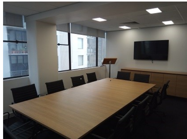
Right is a photo of the new Board room